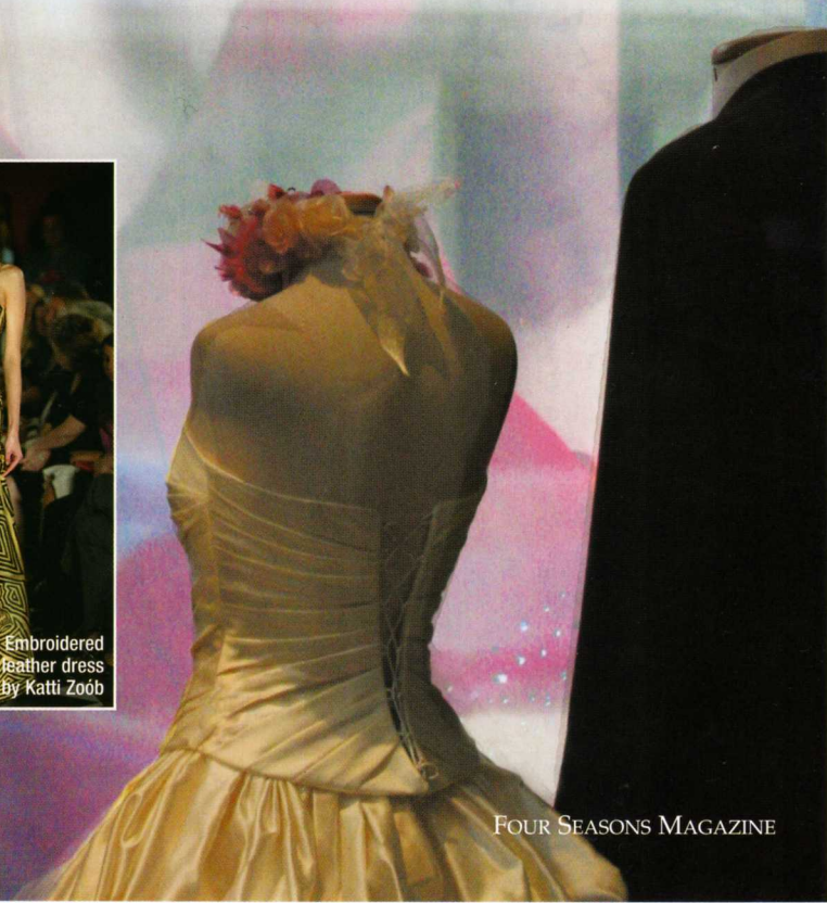
LARGE PICTURE AND FAR LEFT: SEED CORPORATION.COM; CENTRE: COURTESY KATTI ZOÓB