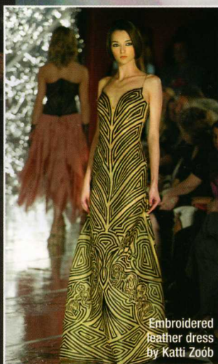
Embroidered leather dress by Katti Zoób